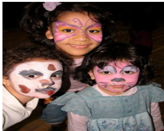
Charities Week fundraiser... page 2